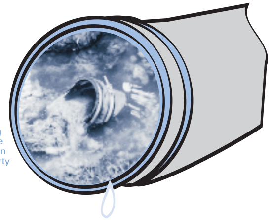
Overflowing cleanout pipe located on private property

Always notify your city sewer/public works department or public sewer district of sewage spills. If the spill enters the storm drains also notify the Health Care Agency. In addition, if it exceeds 1,000 gallons notify the Office of Emergency Services. Refer to the numbers listed in this brochure.