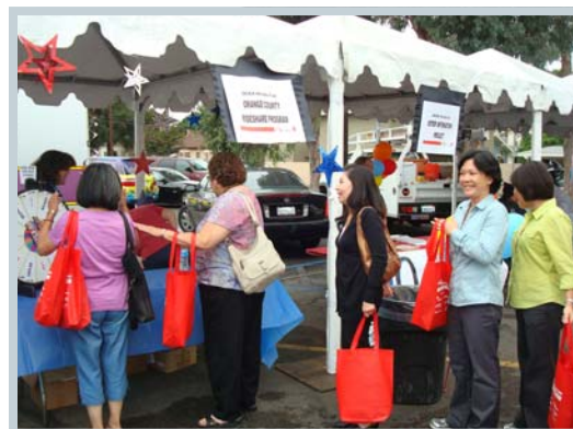
Rideshare Booth at 2011 OCEA Health Fair

We hope you stopped by and gave our prize wheel a spin, won a prize and picked up information about all of the great services and incentives that the Commuter Assistance Program offers to all County of Orange and Superior Court employees.