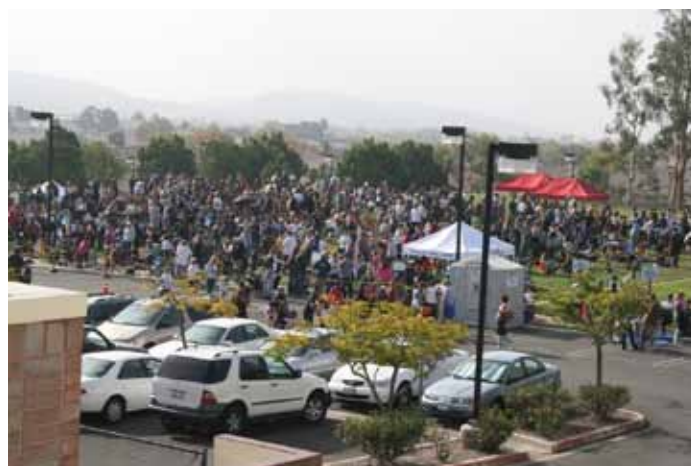
Crowds gather at Cox Communications to get vaccinated