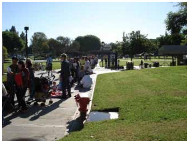
Patients queue up at IVC to receive H1N1 vaccine.

Orange County Medical Reserve Corps volunteered for the Health Care Agency PODs to vaccinate the communities of Orange County for H1N1 and regular seasonal flu. The OC MRC Volunteers enjoyed working the vaccination PODs held at the Crystal Cathedral, Cox Communications, Fullerton College, Cypress City Hall, Irvine Valley College, Santa Ana College, and Public Health Clinics in Santa Ana working with Health Care Agency staff. The Health Care Agency would like to thank all the MRC Volunteers for their time and commitment to the Agency's vaccination clinic goals and meeting the public's needs during this year's flu season.