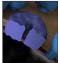
M2 Ion Channel